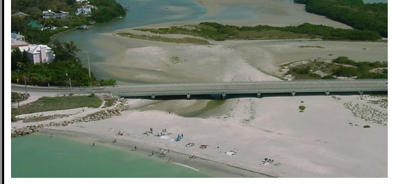
Blind Pass competely closed in 2010