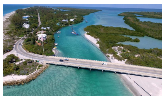
Dredger (top center) inland of the bridge