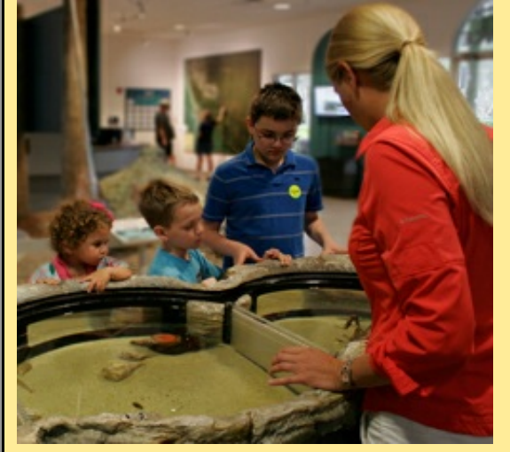
Kids are not the only ones facinated by the displays at the Environmental Learing Center