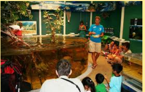
A view of the 180 gallon "Estuary Encounter" with the view-though window