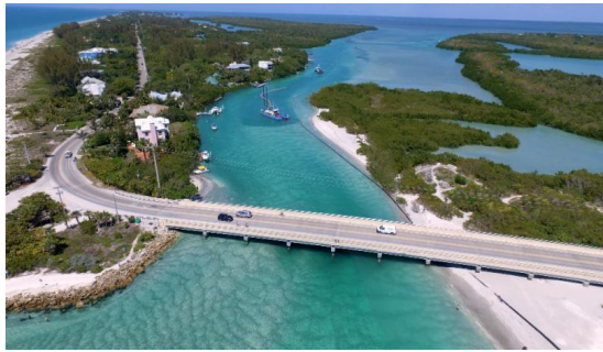
Dredger (top center) inland of the bridge