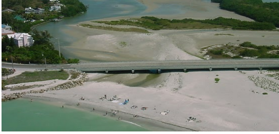
Blind Pass completely closed in 2010