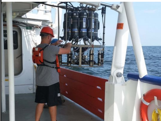
Scientist deploys sensor to detect oxygen levels in Gulf waters in 2015. To help reduce nutrient runoff, information is provided to farmers through the Runoff Risk Advisory Forecasts.