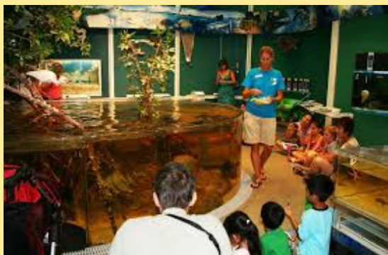
A view of the 180 gallon "Estuary Encounter" with the view-through window