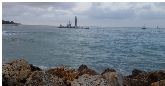
Dredger on Gulf side of Blind Pass

Since the 2009 County construction of the Blind Pass Restoration Project, which opened previously closed Blind Pass, Lee County has led 3 maintenance projects at the Pass to keep the Pass open and bolster portions of eroded beach south of the Pass and at the north end of Bowman's Beach. The latest project began in February and was completed in June.