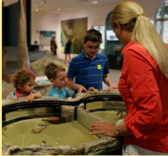
Kids are not the only ones fascinated by the displays at the Environmental Learning Center