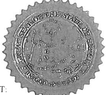
Section 4. This Executive Order shall expire thirty days from this date unless extended.

IN TESTIMONY WHEREOF, I have hereunto set my hand and caused the Great Seal of the State of Florida to flixed, at Tallahassee, this 17th day of Ma