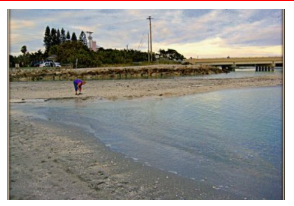
Infilling- Spring 2010